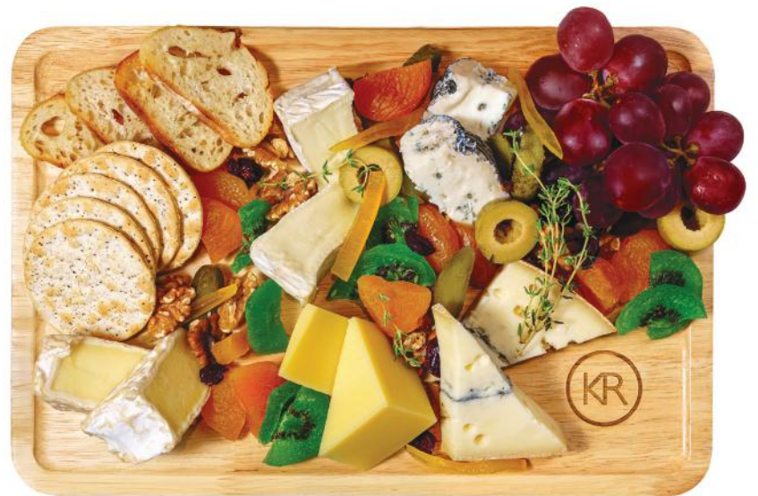
KATA ROCKS' CHEESE BOARD