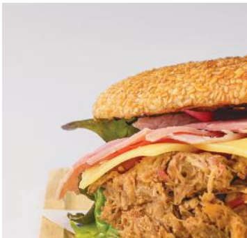
CUBANO BEIGEL 3 2 0

Shaved ham, cheddar cheese, oak leaf lettuce, sliced tomato and Dijon mayonnaise