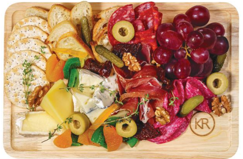
HANGOUT'S SIGNATURE PLATTER