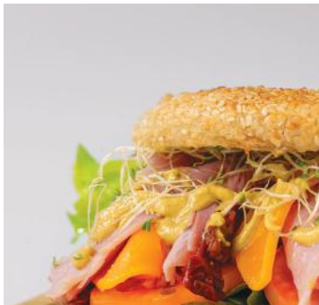
HAM AND CHEESE BEIGEL 2 9 0

Grilled Eggplant, roasted capsicum, zucchini, sundried tomato and feta cheese