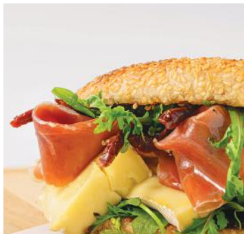
KR HANGOUT BEIGEL 3 2 0

Serrano ham, fig & balsamic chutney with oak leaf lettuce