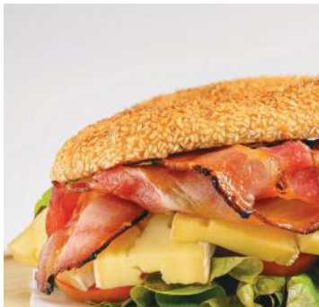
B.B.L.T BEIGEL 2 7 0

Arugula, basil pesto, mozzarella and mayonnaise