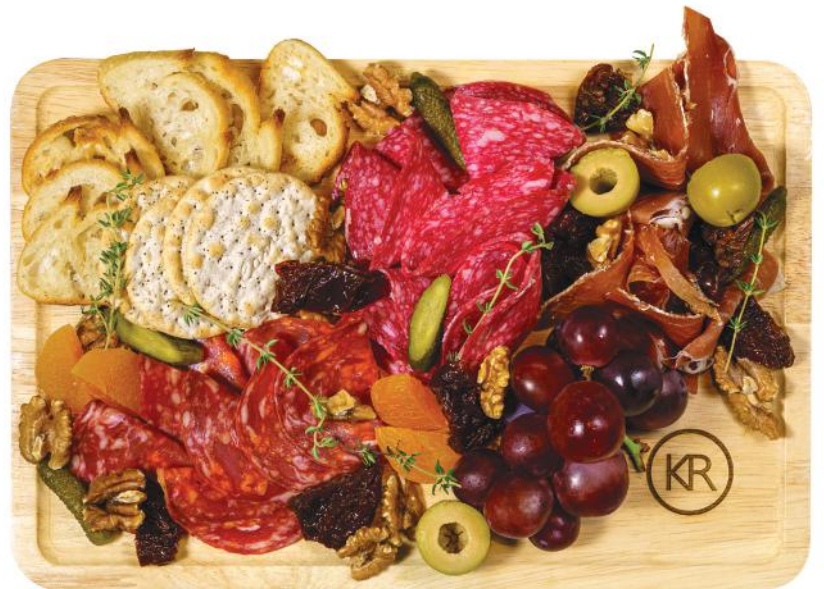
KATA ROCKS' COLD CUT PLATTER