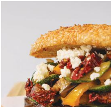
GRILLED VEGETABLE BEIGEL 2 9 0

Brie cheese, bacon, lettuce, tomato and mayonnaise