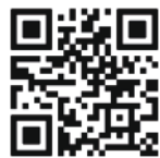
KATA ROCKS WEBSITE