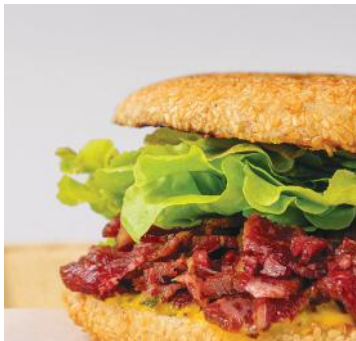
TRADITIONAL ENGLISH SALT BEEF BEIGEL 3 5 0

Apricot chutney, cheddar cheese, parmesan and mozzarella