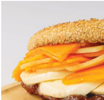
GRILLED 3 CHEESE BEIGEL 2 5 0

Pulled pork, ham, dill pickles, Dijon mustard and Gruyère cheese