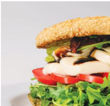
MOZZARELLA AND TOMATO BEIGEL 2 5 0

Serrano ham, fig & balsamic chutney with oak leaf lettuce