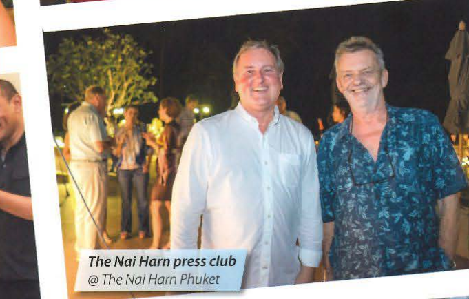
The Nai Harn press club @ The Nai Harn Phuket