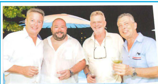
Kata Rocks Superyacht Rendezvous opening party