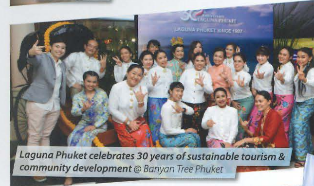
Laguna Phuket celebrates 30 years of sustainable tourism & community development @ Banyan Tree Phuket