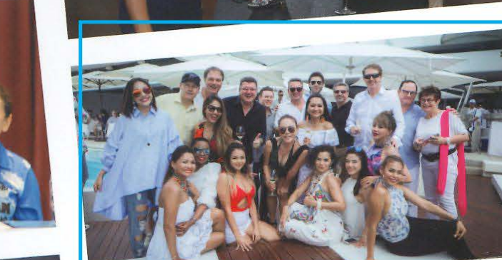
Kata Rocks celebrates 3rd anniversary