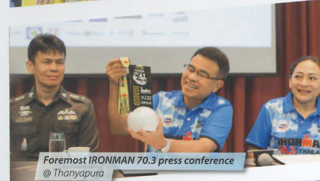
Foremost IRONMAN 70.3 press conference @ Thanyapura