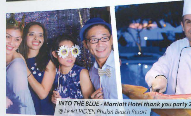
INTO THE BLUE - Marriott Hotel thank you party 2017 @ Le MERIDIEN Phuket Beach Resort