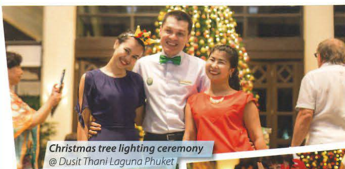
Christmas tree lighting ceremony @ Dusit Thani Laguna Phuket