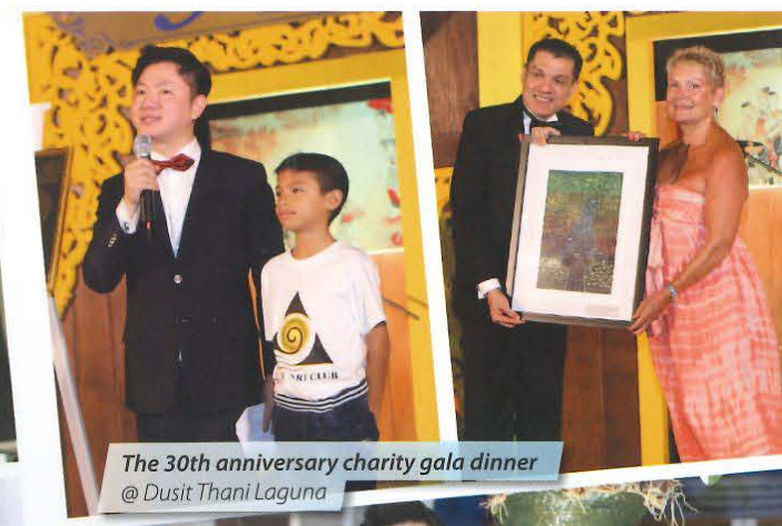
The 30th anniversary charity gala dinner @ Dusit Thani Laguna