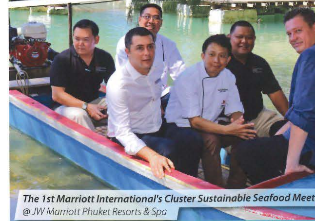
The 1st Marriott International's Cluster Sustainable Seafood Meeting @ JW Marriott Phuket Resorts & Spa