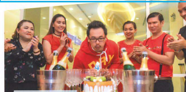
4th years anniversary Sleep With Me design hotel Patong