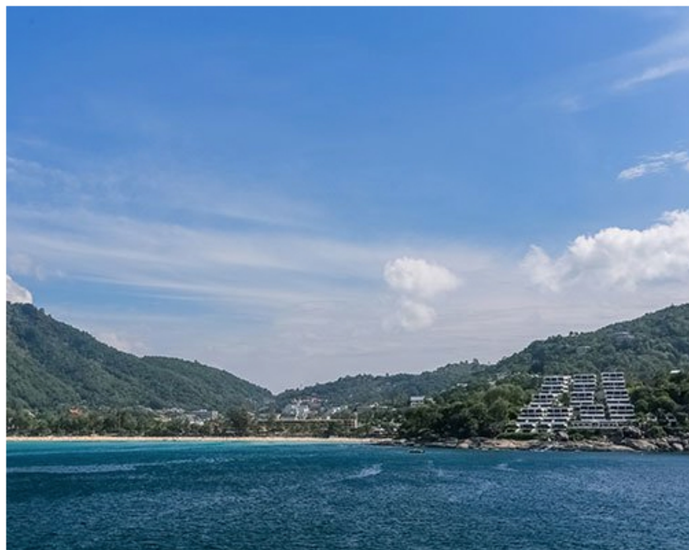
Kata Rocks, Phuket – view of Kata Beach

The sparkling sunset sets the scene as we check in for cocktail happy hour on the beach and the Ibiza beach club vibe rolls on into the night. Akyra Beach is the perfect paradise escape. All you need is a bikini, a book and a bum to sit on, and you're tucking in to a hefty slice of serious luxury.