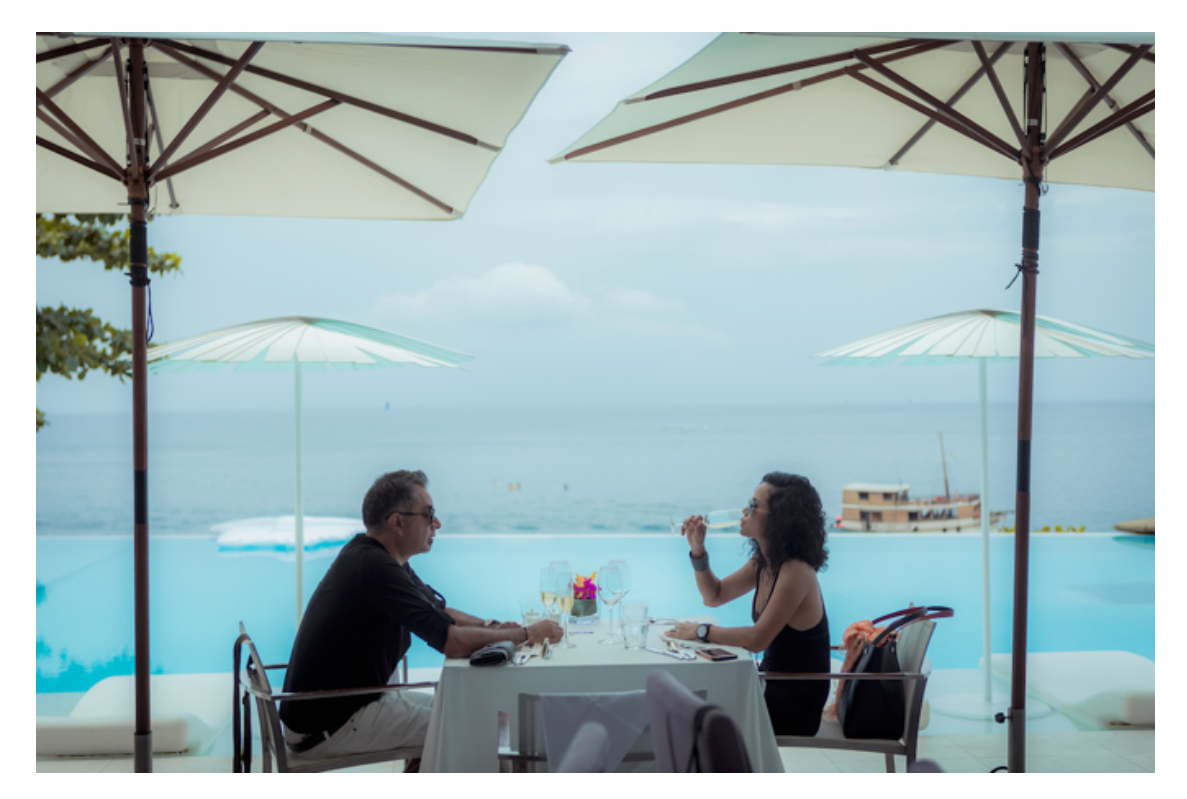
Guests enjoying the afternoon sun by the resorts iconic Infinity Pool and ocean views