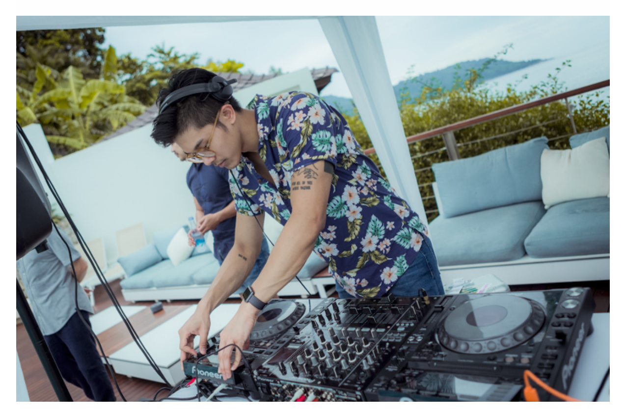
Bangkok's Slum Disco Soundsystem spinning a fun mix of funk, boogie, disco, and house with amazing live trumpet performances