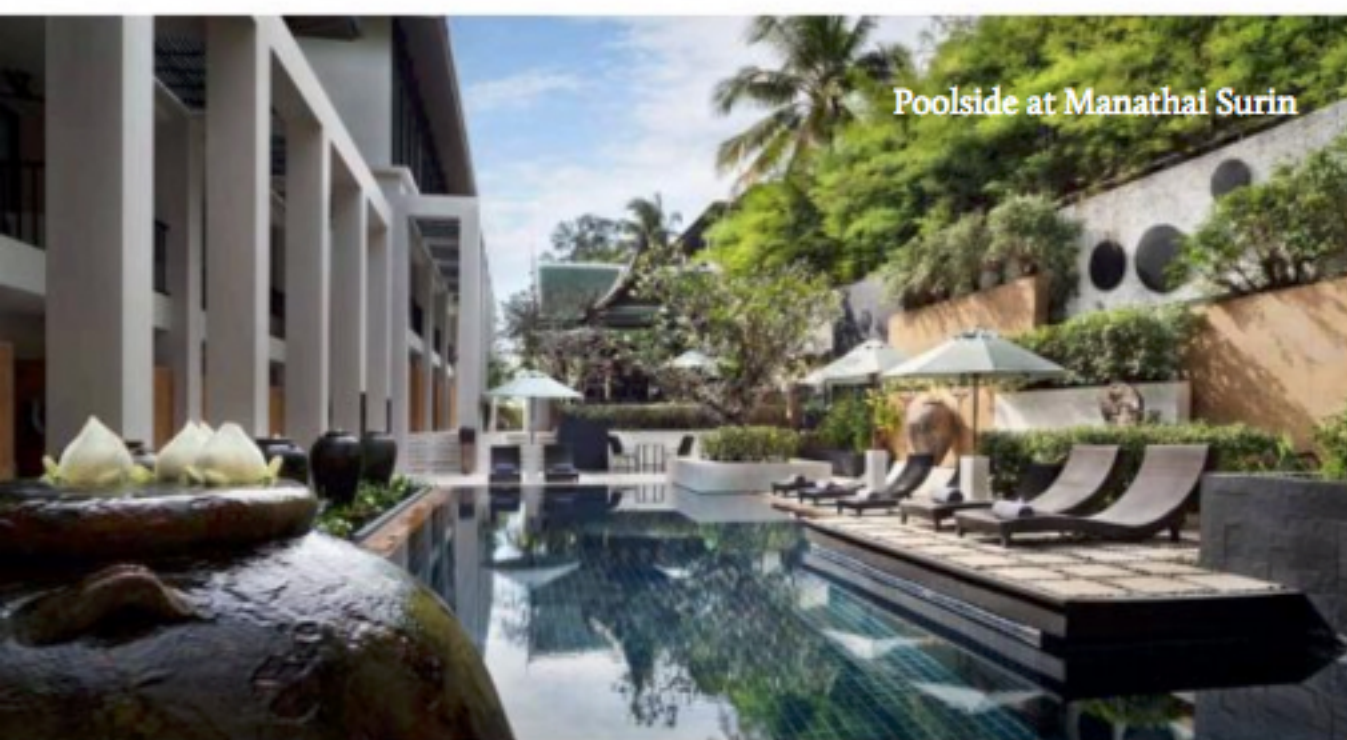
Poolside at Manathai Surin

collection of vintage wines and innovative flavours. The wines are playfully paired with an array of artisanal cheeses.