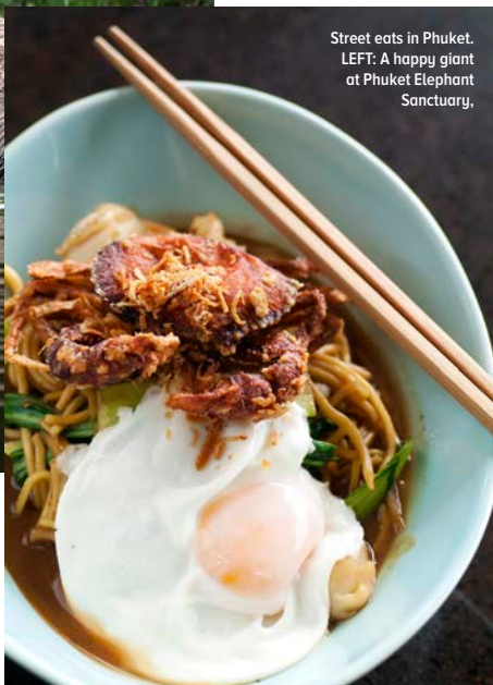
Street eats in Phuket. LEFT: A happy giant at Phuket Elephant Sanctuary.

The Phuket Elephant Sanctuary is a refuge for elephants rescued from the tourist and logging industries. It's the first of its kind on the island and no riding is allowed. Instead, travellers can have an ethical encounter watching the animals as they bathe, play and walk in the grounds. A-list visitors have included Coldplay, Britney Spears and Leonardo DiCaprio. ✈️