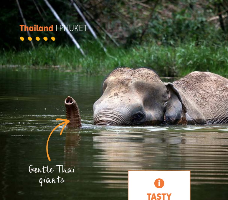
Gentle Thai giants