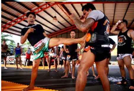
Service with a smile at The Aquila. ABOVE: Tiger Muay Thai.