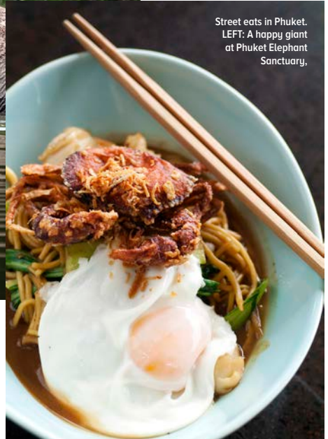
Street eats in Phuket. LEFT: A happy giant at Phuket Elephant Sanctuary.

The Phuket Elephant Sanctuary is a refuge for elephants rescued from the tourist and logging industries. It's the first of its kind on the island and no riding is allowed. Instead, travellers can have an ethical encounter watching the animals as they bathe, play and walk in the grounds. A-list visitors have included Coldplay, Britney Spears and Leonardo DiCaprio. ✈️