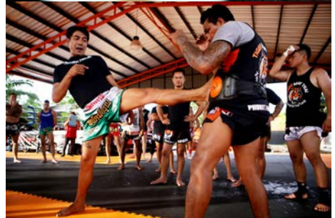
Service with a smile at The Aquila. ABOVE: Tiger Muay Thai.