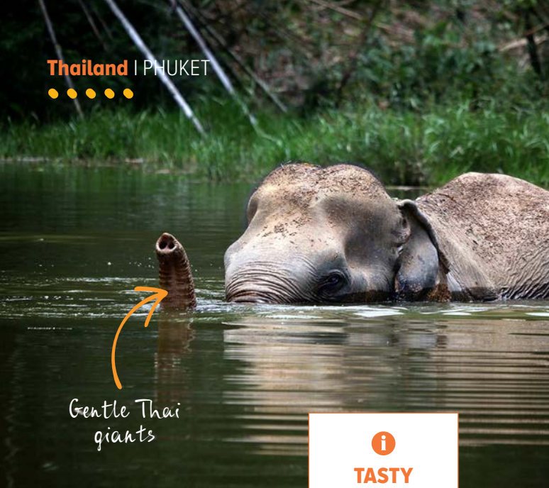
Gentle Thai giants