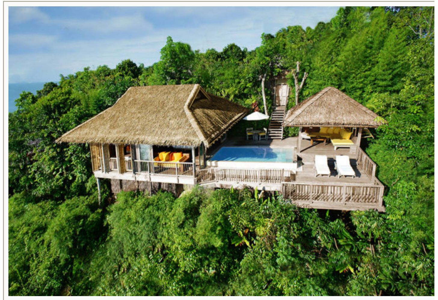
Ocean views from Pool Villa Bedroom