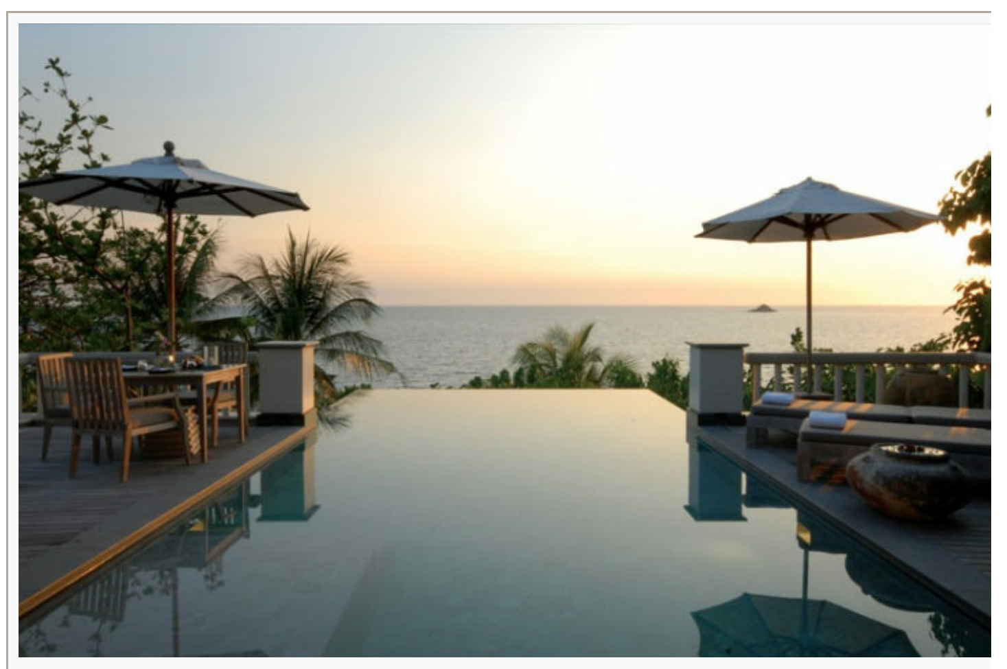
Sunset from your marble infinity pool