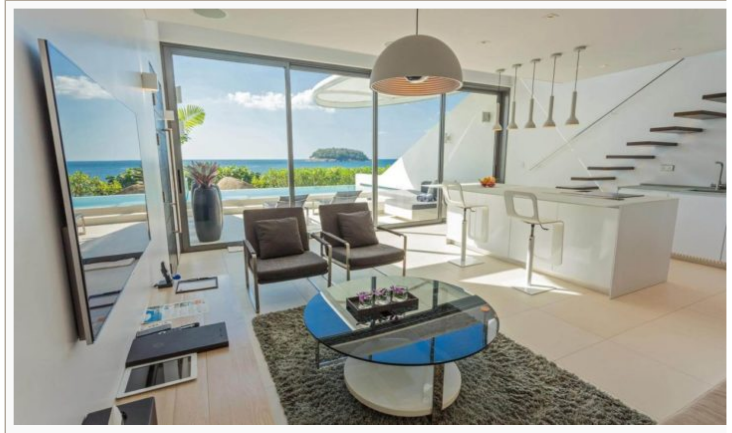
Stylish one-bedroom Ocean Loft