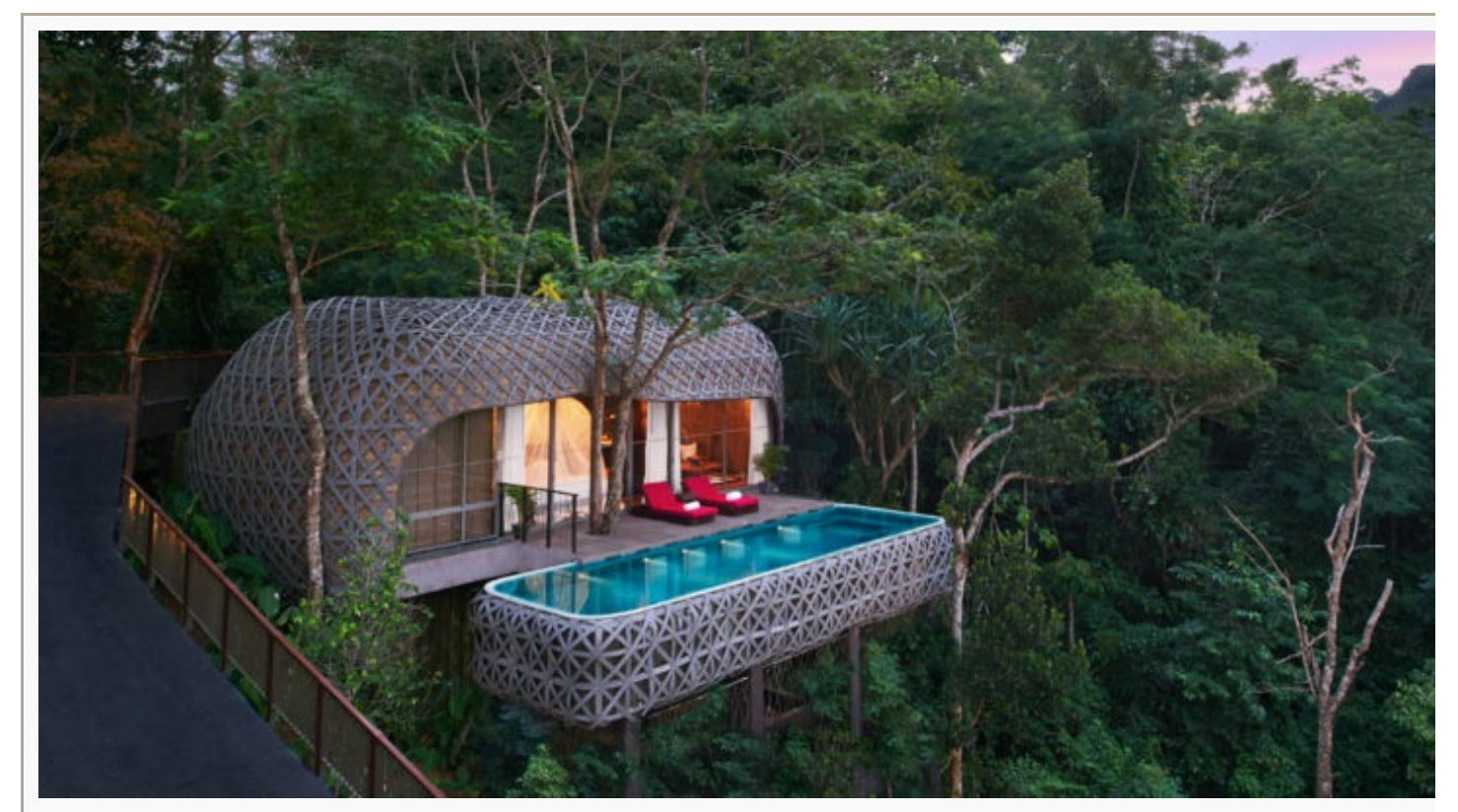
Live in the trees in a Bird's Nest Villa