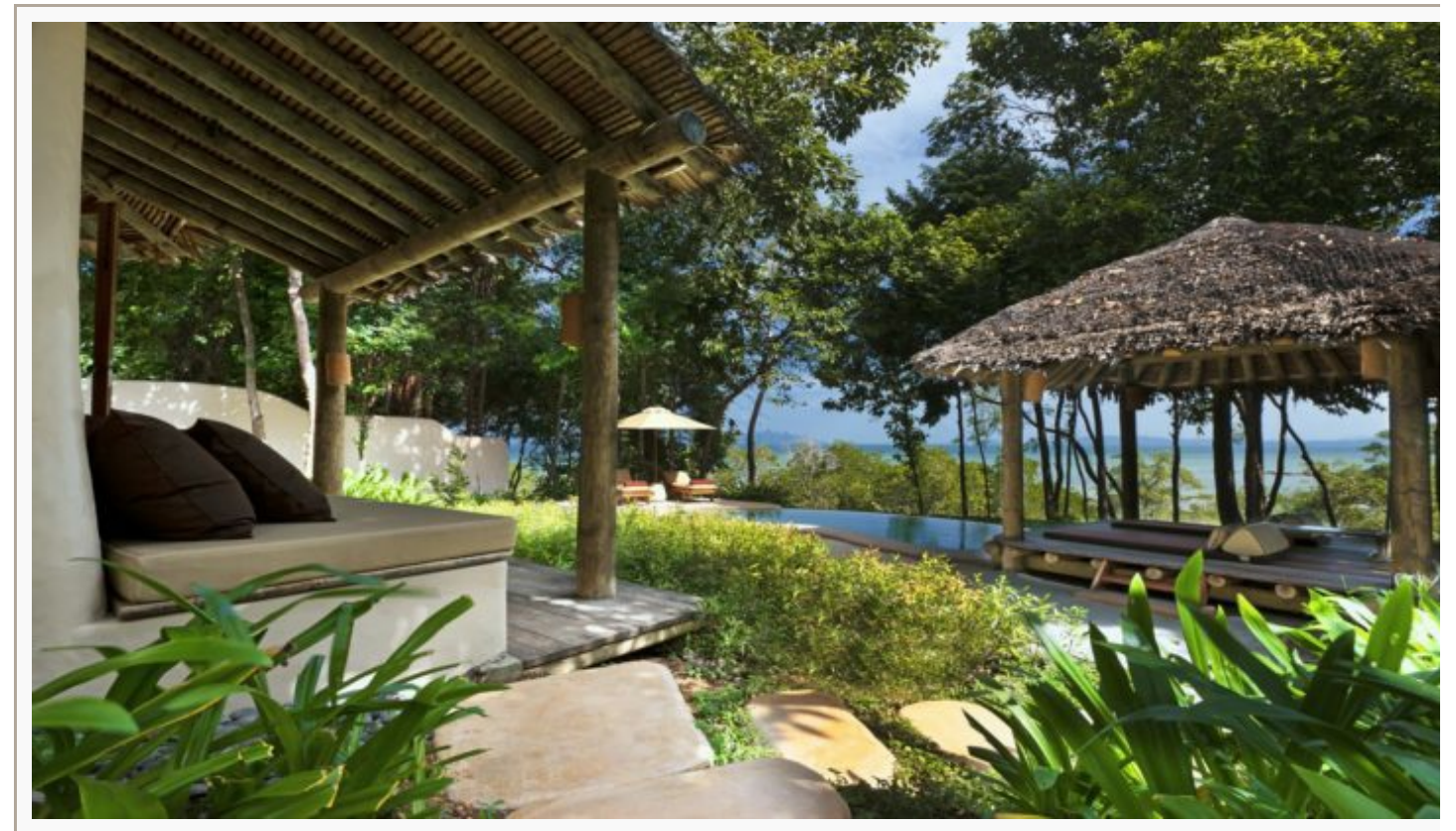
Shrouded Sea View Pool Villa