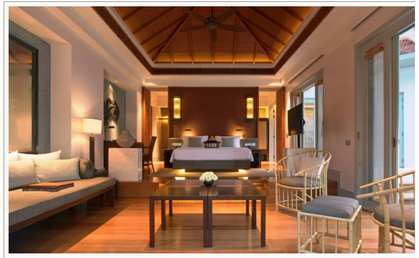
Luxurious Ocean View Pool Villa