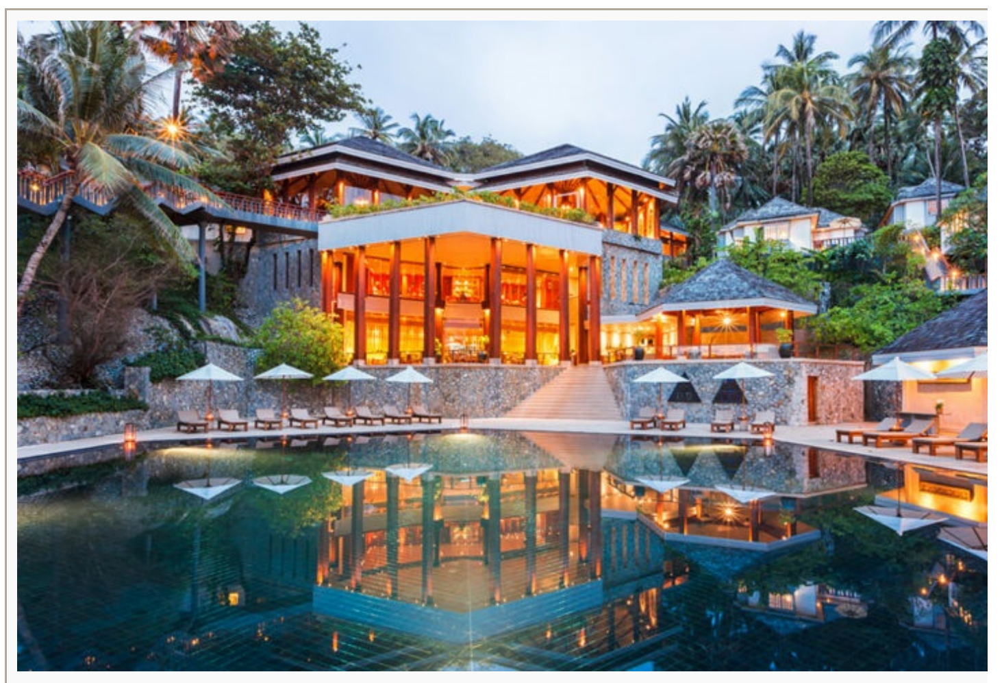
Outdoor pool and hotel exterior