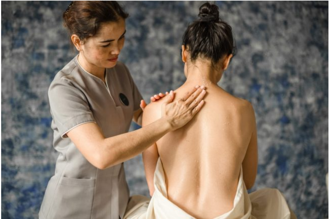
The spa focuses on Thai treatments

Featuring the latest spa massage technology, Infinite Luxury Spa at Kata Rocks has eight luxury treatment rooms and suites, including a chromotherapy room for coloured light therapy, a waterbed room equipped with an Italian-made Iso-Benessere water massage bed for aiding spinal integration, and a sleeping pod room with Metronap rest pod amongst the usual treatment rooms.