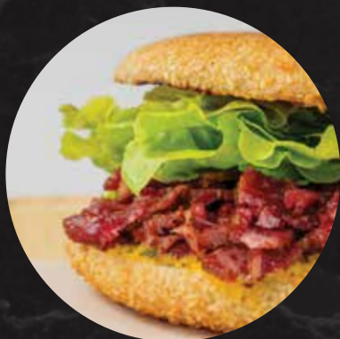
TRADITIONAL ENGLISH SALT BEEF BEIGEL 350

Brie cheese, bacon, lettuce tomato, and mayonnaise