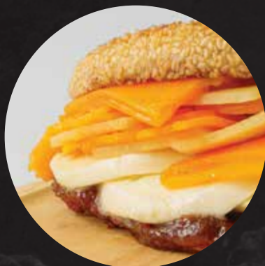
GRILLED 3 CHEESE BEIGEL 250

Homemade wagyu salt beef, dill pickles, and Coleman's english mustard