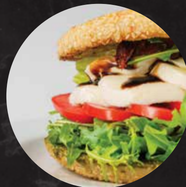
MOZZARELLA AND TOMATO BEIGEL 250

Apricot chutney, cheddar cheese, parmesan, and mozzarella