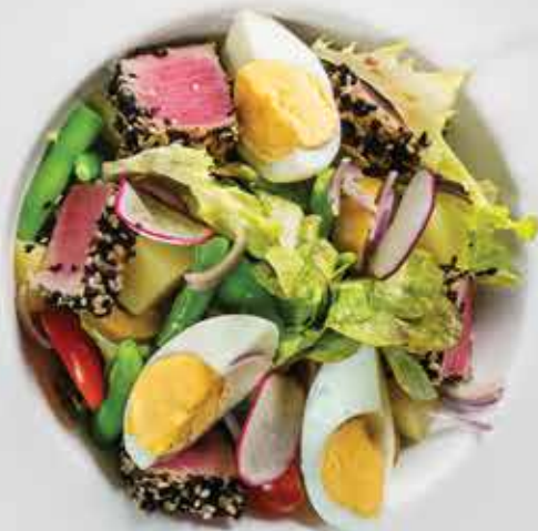
NIÇOISE SALAD 2 4 0

with chopped smoked salmon, sesame pickled ginger edamame, cucumber avocado and honey lime dressing