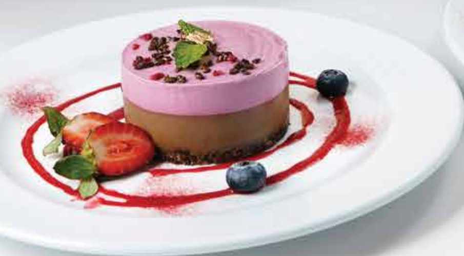
VEGAN CHOCOLATE RASPBERRY