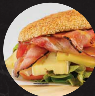
B.B.L.T BEIGEL 270

Shaved ham, cheddar cheese, oak leaf lettuce, sliced tomato, and Dijon mayonnaise