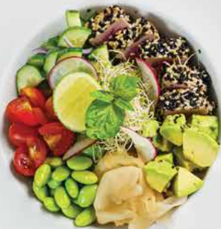
TUNA QUINOA POKE BOWL 3 2 0

Seared tuna loin, pickled ginger, edamame cucumber, avocado and sesame dressing