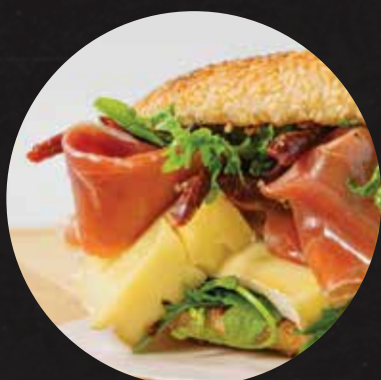
HANGOUT BEIGEL 320

Arugula, basil pesto, mozzarella and mayonnaise