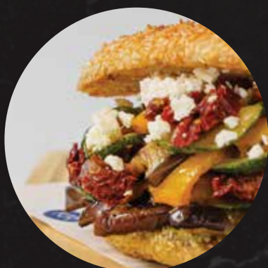
GRILLED VEGETABLE BEIGEL 290

Grilled Eggplant, roasted capsicum, zucchini, sundried tomato, and feta cheese