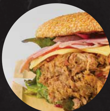
CUBANO BEIGEL 320

Serrano ham, fig and balsamic chutney, and oak leaf lettuce