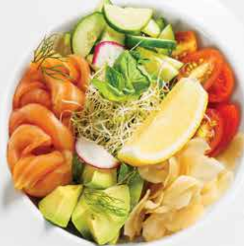
SMOKED SALMON QUINOA POKE BOWL 3 2 0

Seared tuna loin, pickled ginger, edamame cucumber, avocado and sesame dressing