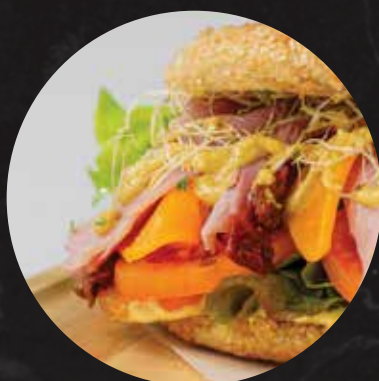
HAM AND CHEESE BEIGEL 290

Grilled Eggplant, roasted capsicum, zucchini, sundried tomato, and feta cheese