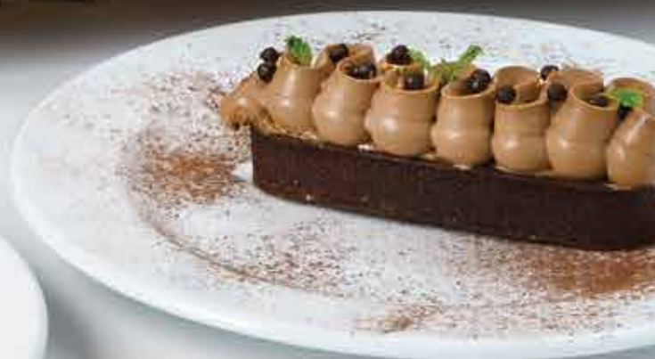
CHOCOLATE HAZELNUT TART