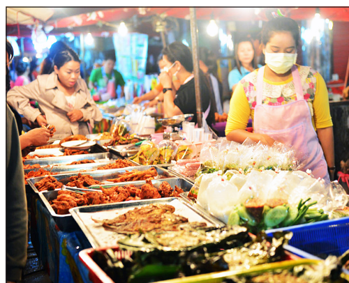
Thailand was named as a 'street food paradise'.

The Ministry of Foreign Affairs, in co-operation with Thailand Foundation, has launched a new mobile application for Thai street food, aimed at assembling information on all of the country's top roadside eateries.