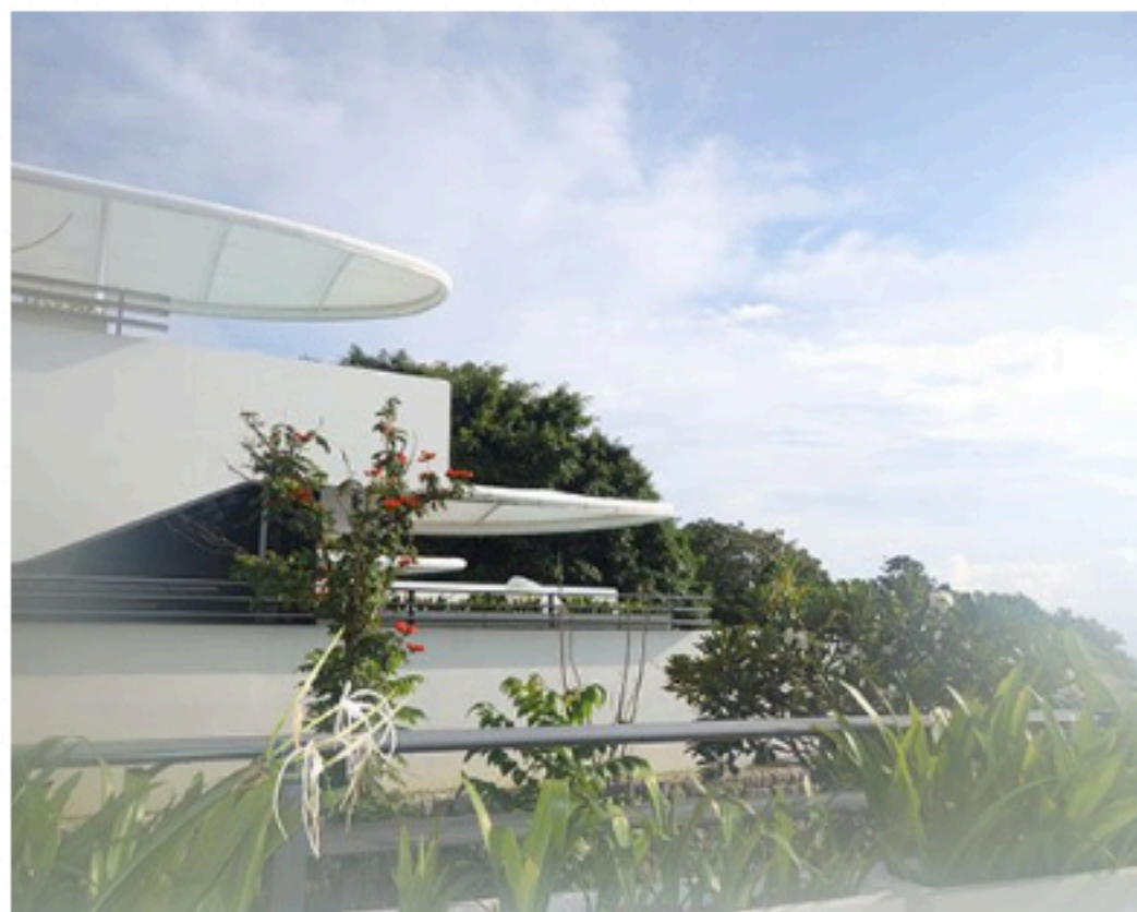
Kata Rocks, Phuket – views

Taking the luxury lifestyle to a whole new level, Kata Rocks brings an essence of contemporary, western-inspired flavour to our tour of Thailand. So finally, to bring a bit of rustic, island life back into the mix, we sail over the seas to grab a taste of real island paradise at Koh Yao – recommended to us as Thailand's last unspoilt island.