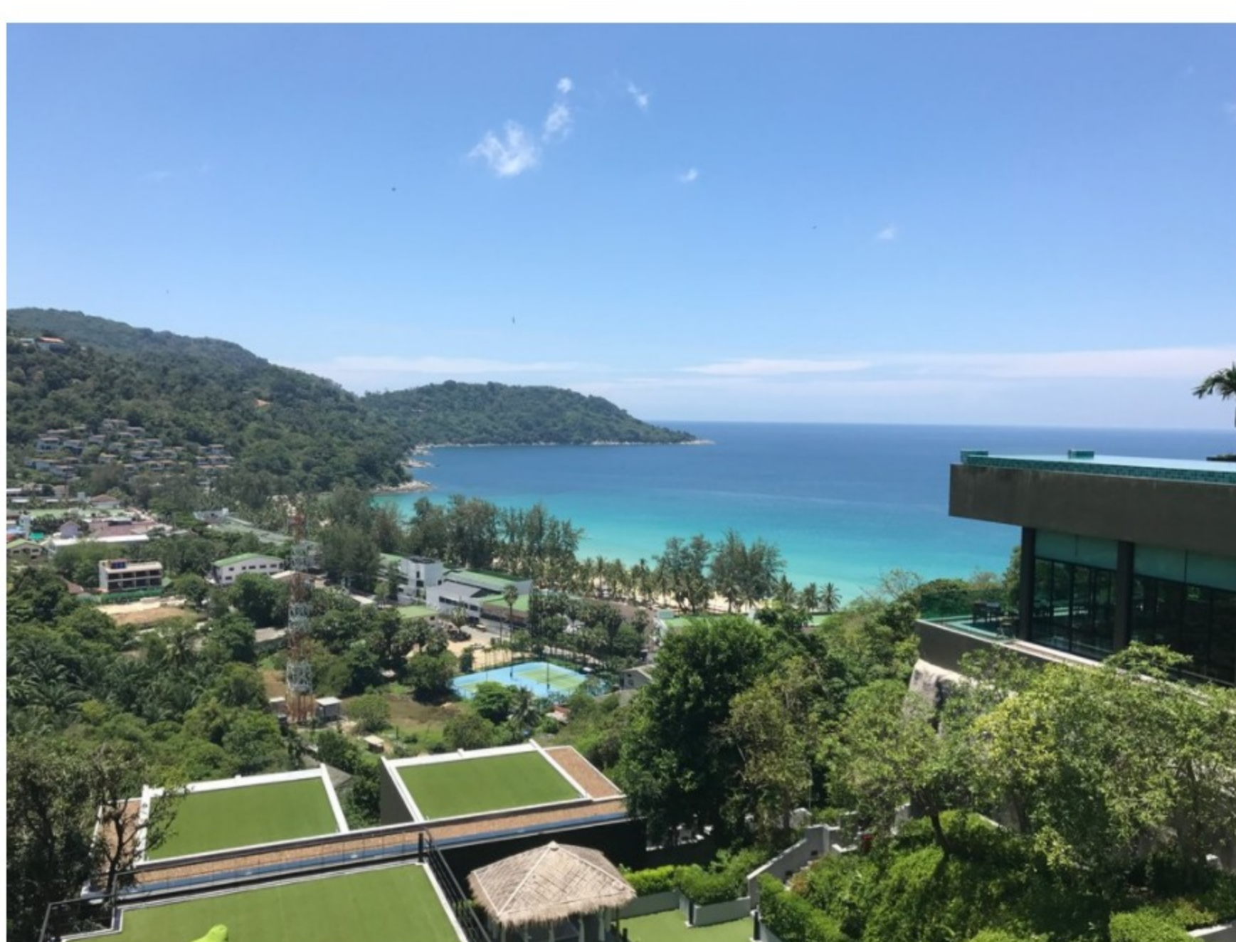
The view from Foto Hotel

We stopped at Kata Rocks (pictured above) for Sunday lunch. The staff was great, the food was delicious and the poolside view is spectacular on a sunny day. Be sure to try the hot chocolate cake and the delicious Gaeng phoo bai cha plu, a southern-style (Southern Thailand, that is) crab curry dish very different from what you'll find in Bangkok. Spending a few hours here definitely staved off the Sunday Blues.