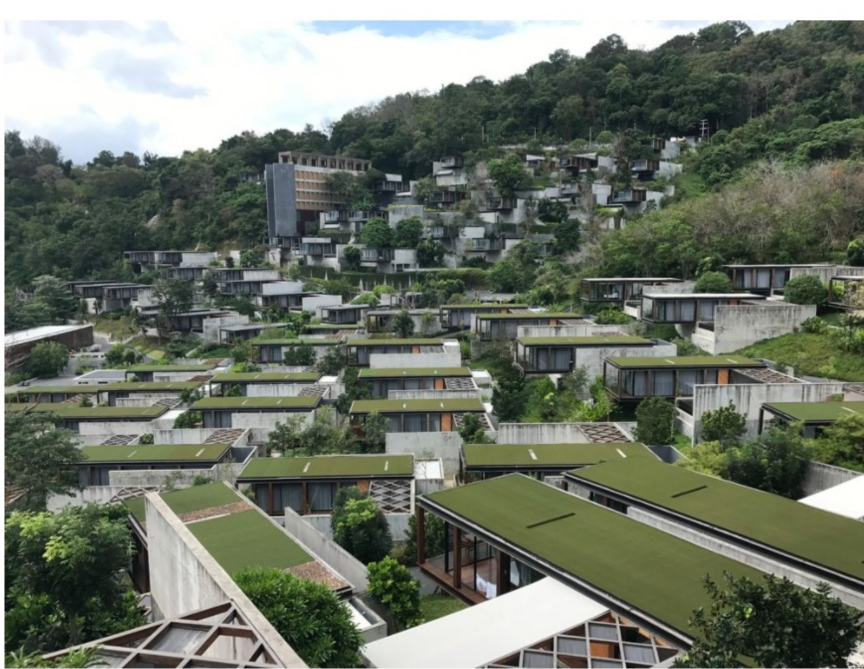
The Naka Phuket

Located up the hill from Kata Rocks in Kata, Nook-Dee and Foto Hotel have a fantastic view. Be sure to check out Nook-Dee's out-of-the-way rooftop area for a more private and panoramic view of the nearby beaches.