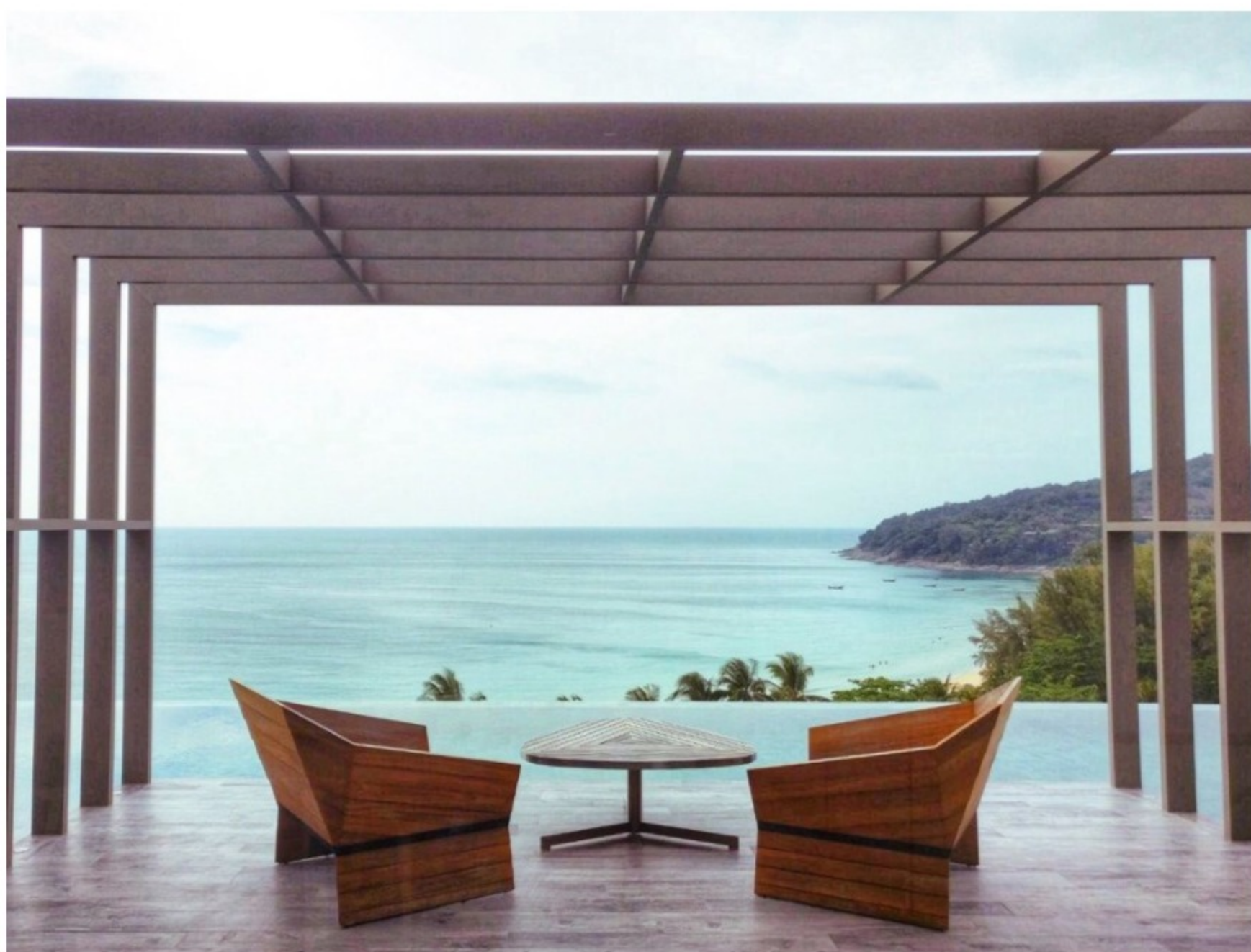
The view from a private villa in Phuket

Nestled within a protected national park, Anantara Layan has some great views and beach front. Take a glimpse from the tiny wedding chapel at the top in particular.