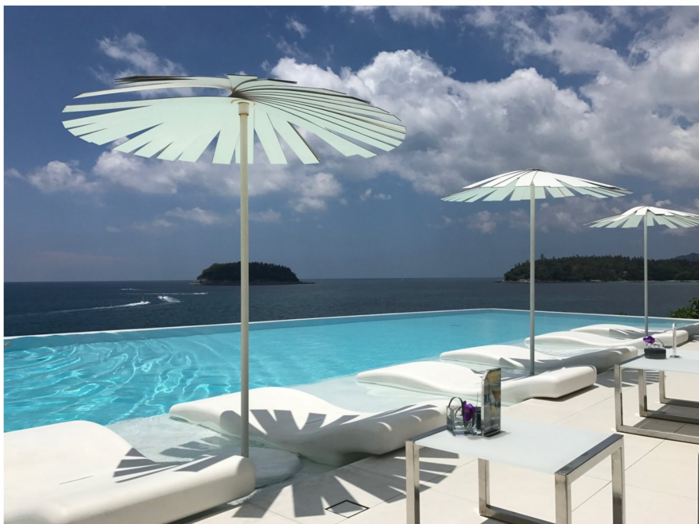
The view from Kata Rocks

Lately we've been searching high and low for wedding venues. Luckily, Phuket has dozens of incredible hotels with views that make the rest of the world melt away. Since we've seen pretty much every place on the island (not really, but it sure feels like it), we thought we would share of the hotels with the best views in Phuket. Here are a few of our favorites: