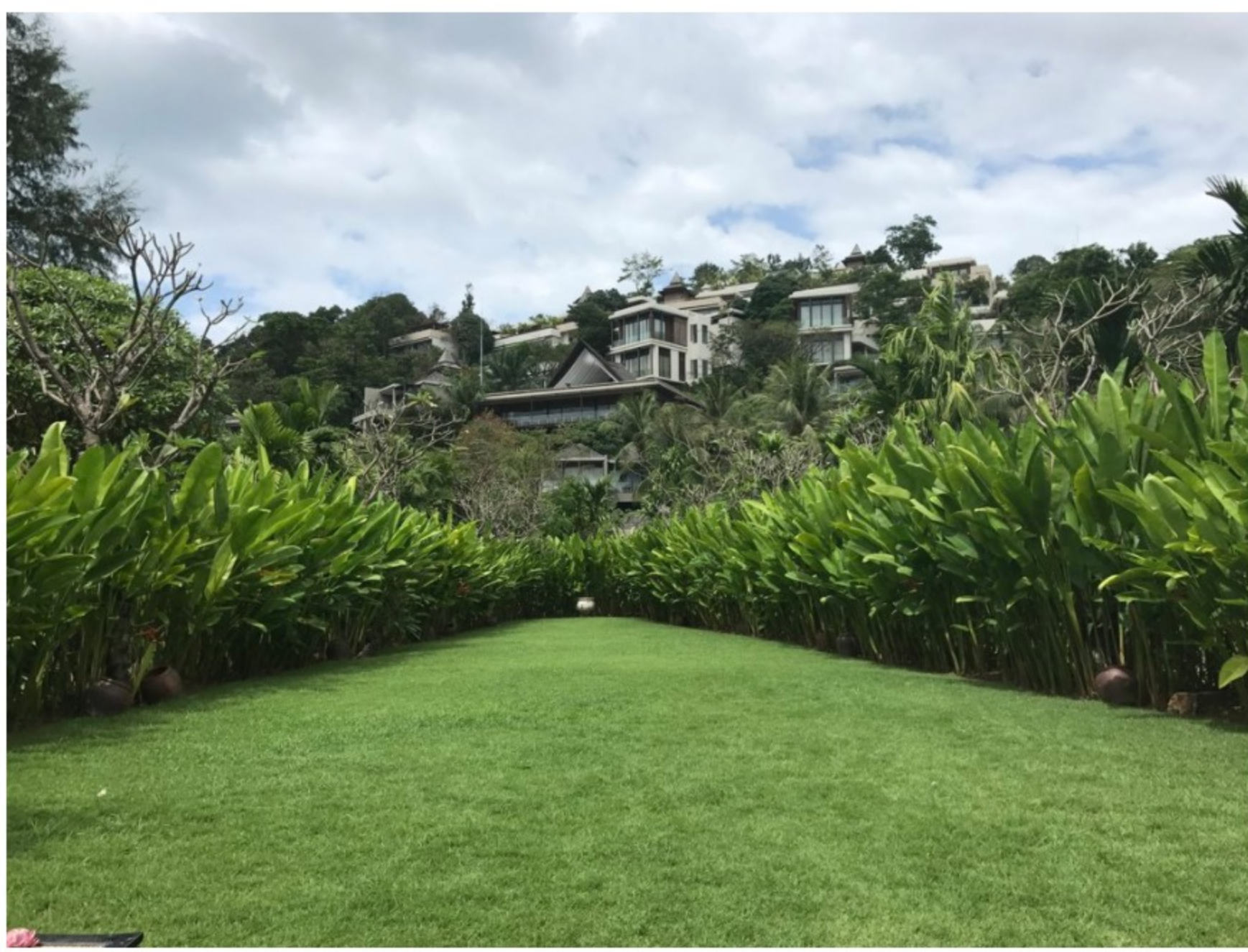
The villas at Anantara Layan offer some beautiful views of the protected national park

The Naka Phuket place is stunning. The best view of the hotel is from the lobby which is perched above this gorgeous scene. It feels like something out of a movie (and actually, we hear Blake Lively filmed here). On a little side note, we were less than impressed with the wedding staff, who quickly talked us out of any reason to choose this as our wedding venue.