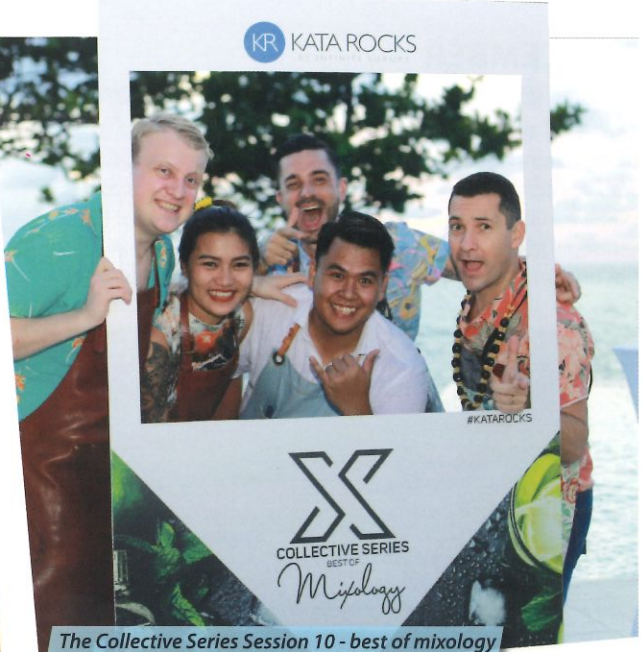
The Collective Series Session 10 - best of mixology @ Kata Rocks