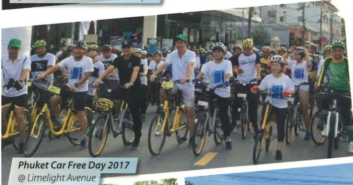
Phuket Car Free Day 2017 @ Limelight Avenue