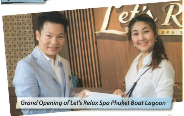
Grand Opening of Let's Relax Spa Phuket Boat Lagoon