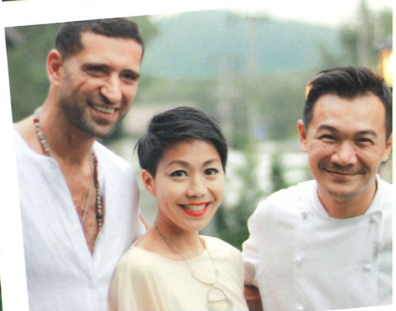
Suay Restaurant Cherng Talay Grand Opening Party