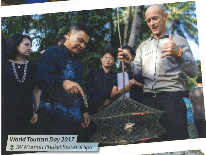
World Tourism Day 2017 @ JW Marriott Phuket Resort & Spa